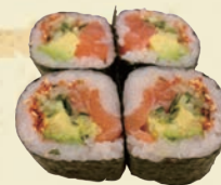
Spicy Salmon Maki