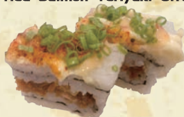
Fried Salmon Teriyaki Gift