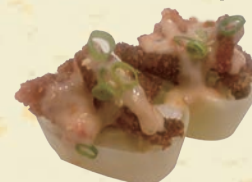
Fried Salmon Green B/Ship