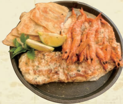
6 Medium Prawns & Hake R139.00