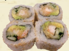
Tempura Prawn California Roll