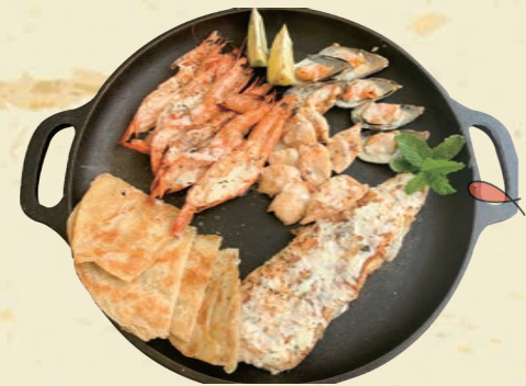
Medium Platter R269.00