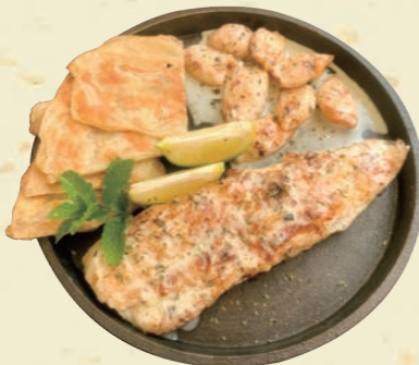
Hake & Calamari R139.00