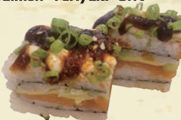
Salmon Teriyaki Gift