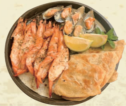
6 Medium Prawns & 6 Mussels R139.00