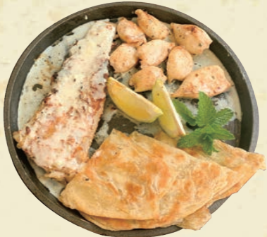
Kingklip & Calamari R139.00