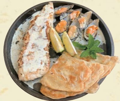
Kingklip & Mussels R139.00