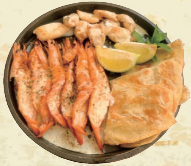
6 Medium Prawns & Calamari R139.00

Grilled with lemon butter sauce Served with pancake rice or chips.