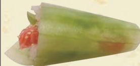
Salmon Designer Hand Roll