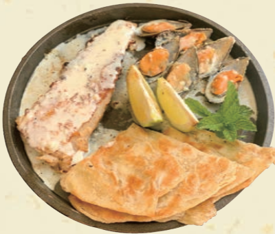
Hake & Mussels R139.00