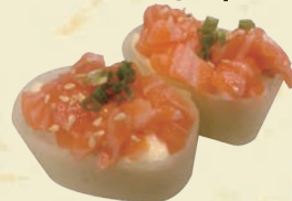
Salmon Green B/Ship