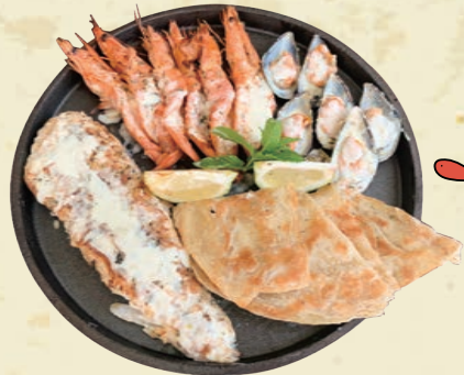
Mini Platter R199.00