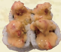
Rock Prawn Maki