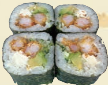
Fried Prawn Maki