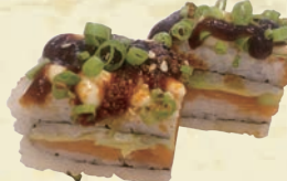
Salmon Teriyaki Gift