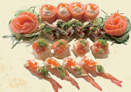
Platter 4 (22pcs) R515.00 Salmon Sashimi (6pcs) Salmon Rose (4pcs) Salmon Cake (4pcs) Salmon Teriyaki Gift (4pcs) Prawn Top Nigiri (4pcs)