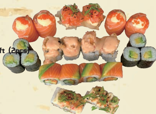
Platter 11 (28pcs) R532.00