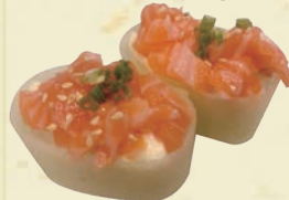
Salmon Green B/Ship