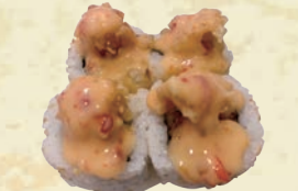
Rock Prawn Maki