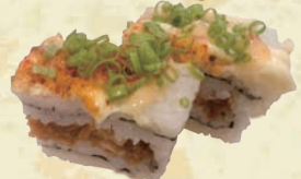
Fried Salmon Teriyaki Gift