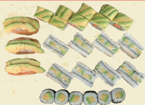
Platter 8 (25pcs) R279.00 Avocado Inari (3pcs) Avocado Maki (6pcs) Dragon Maki (8pcs) Avocado Sandwich (8pcs)