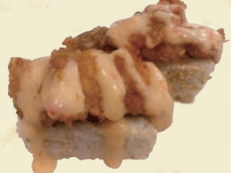
Fried Salmon Gift