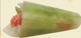
Salmon Designer Hand Roll