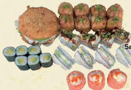
Platter 5 (26pcs) R455.00 Prawn Burger (1pc) Salmon Rose (3pcs) Salmon Teriyaki Gift (4pcs) Prawn Sandwich (4pcs) Avocado Maki (6pcs) Fried Sushi (8pcs)