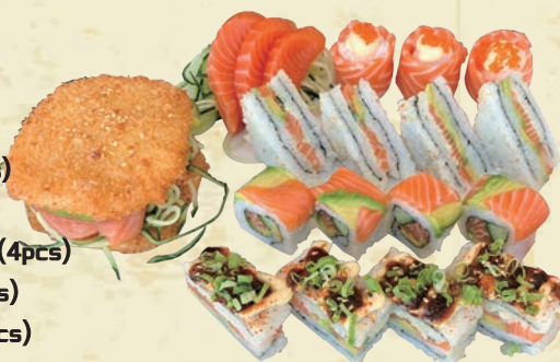
Platter 7 (23pcs) R375.00