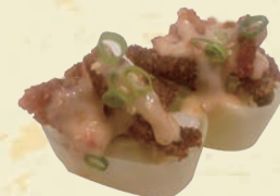
Fried Salmon Green B/Ship