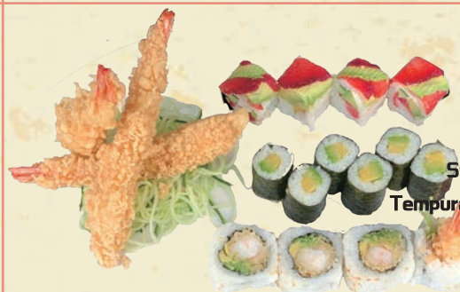
Platter 9 (17pcs) R199.00 Tempura Prawns (3pcs) Strawberry Rainbow (4pcs) Tempura Prawn California (4pcs) Avocado Maki (6pcs)